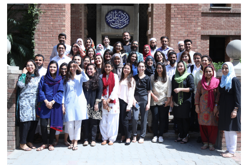
Batch picture of SOE class of 2020

Various sessions were held to familiarise the incoming batch with LUMS policies. The session concluded with the hope that twenty years down the lane, the School of Education will be a dynamic and innovative leader in the education landscape, and the students will uphold ethics and positive values during their pursuit of transforming the society.