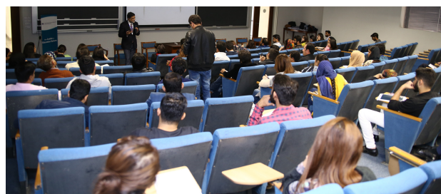
MPhil ELM information session at LUMS open day 2018