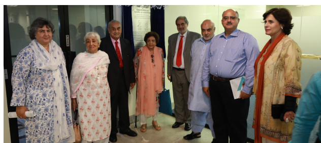
Syed Babar Ali at the SOE inauguration with his family