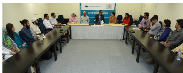
MoU signing between LUMS SOE and Akhuwat