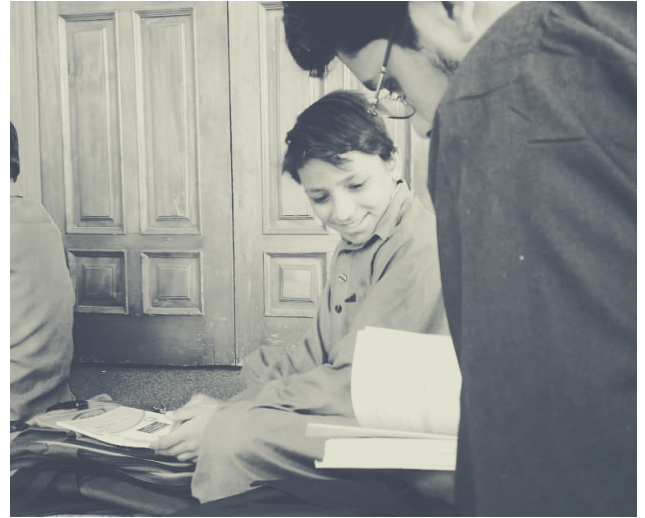
An MPhil ELM student on a school visit