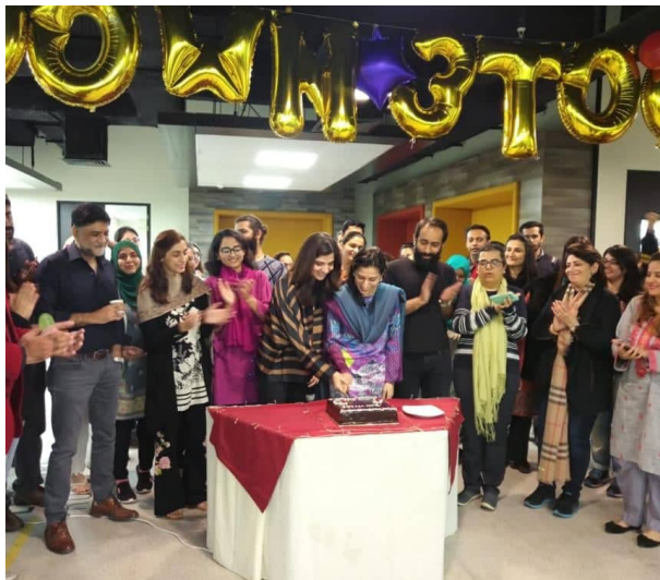
SOE team and students at the end of semester party